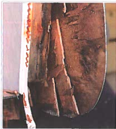
Water Damage to a Luan sidewall