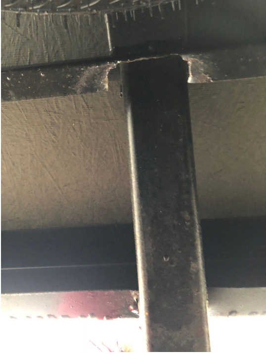
Broken weld on 2nd C channel in from rear bumper