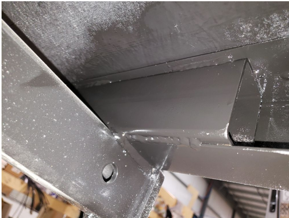
New reinforcement tube welded into C channel for extra support *This is not the only way to support it, the dealer can support it in a variety of ways