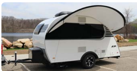
Visor accessory shown on Little Guy Mini Max.

Please note: All options, colors, and design features are subject to change. Please check with your local dealer for most recent options available. Xtreme Outdoors and Little Guy Trailers reserve the right to make changes to product pricing and specifications at any time.